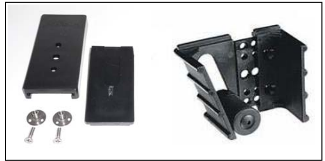
GRIP-IT TOOL HOLDER PACKAGE