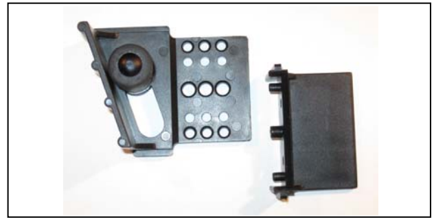
ADJUSTABLE GRIP-IT TOOL HOLDER